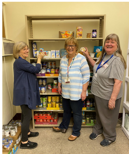
Pictured: Junior Group members stocking the pantry

Did you know that Youngstown Area Goodwill Industries has an internal food pantry to help support its employees?