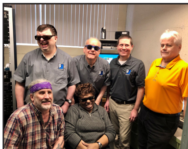
Pictured: The Youngstown Radio Reading Team

Monthly meetings will be held the third Thursday of each month at 10 a.m. at Youngstown Goodwill's main office, 2747 Belmont Avenue in Youngstown. Individuals