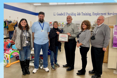
The award presentation at our Calcutta location.

We're proud to continue to offer diverse and inclusive workplaces in the community where individuals can find meaningful employment and growth opportunities.