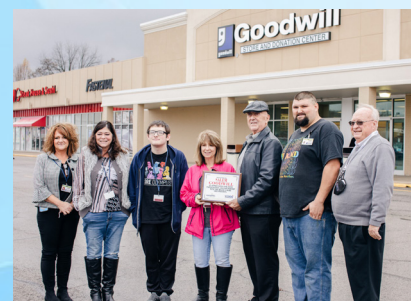
The award presentation at our Salem location.

Youngstown Area Goodwill Industries is honored to have accepted two awards for our Salem and Calcutta locations from Reach 4 More, a jobs development program of the Columbiana County Board of Developmental Disabilities.